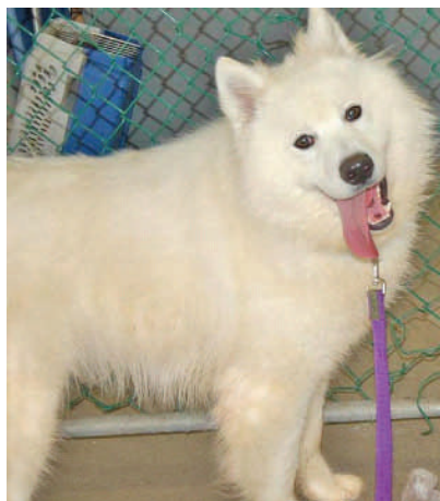
Blizzard while in the shelter. Below, Blizzard with his sister Sophie (on the couch) and his new owner enjoying a new life. Isn't it great being loved?

Blizzard's foster family thought this was a sign of a medical problem, and took him to the vet. The vet ran some tests and found that Blizzard had a thyroid condition. Blizzard was started on Soloxine, a medication commonly used to control seizures in dogs. Blizzard had more blood tests done a few weeks later to make sure that he had the correct dose of medication. Once Blizzard had been on the medication for a little while, he was back to his old, sweet self. Shortly after this, Blizzard was adopted into a wonderful home. His new owner was very patient and got a trainer to come to his house and help him work with Blizzard on his possessiveness of toys, since moving to a new home and family can cause issues like that to flare up. As you can see, Blizzard is very happy, loved and well cared for in his new home with his sister Sophie.